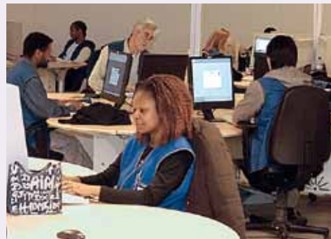
Outsourcing – Videocoding