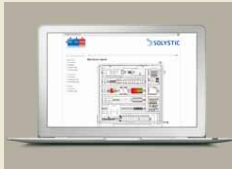
Supervision – easy-View