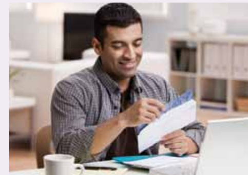
Multi-channel communication – MailEbox