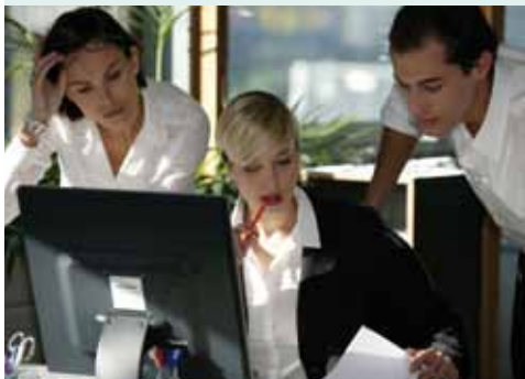
Audit, process and technology analysis

We have the right proposals to support you in your major projects. Based on a review of the existing infrastructure, we propose the best choices by integrating the right technologies and organisation for your needs and the needs of your own customers.